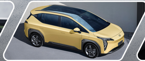
Trendy Exterior Design