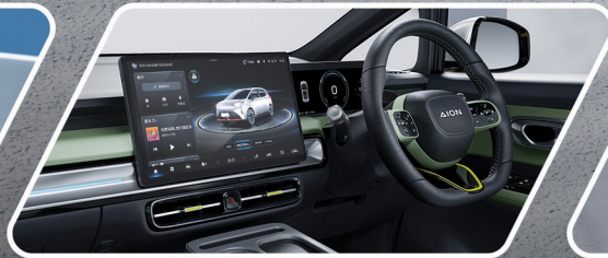
Trendy Smart Technology