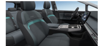
DARK GREY COLOR