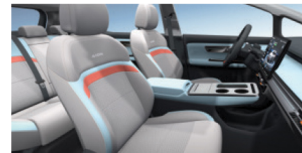
LIGHT BLUE COLOR