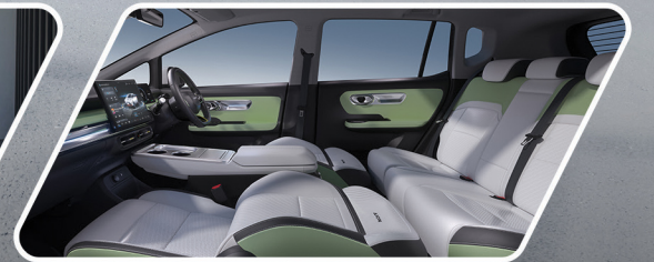
Trendy Spacious Interior